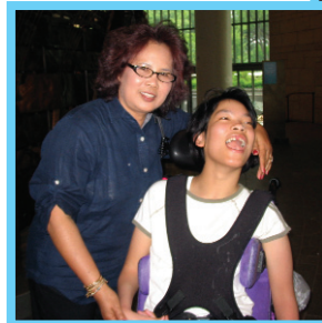
A St. Mary's resident and her mother enjoy time together in Washington, D.C.

The St. Mary's troop became official in November 2005. A volunteer from the community serves as the troop leader, and two key staff