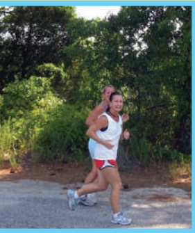
Runners at First Landing State Park enjoy the natural surroundings

What's healthy, scenic and fun? This year's 5K Run! Set in the picturesque tranquility of First Landing State Park, in Virginia Beach, St. Mary's Annual 5K and One-Mile Fun Run takes place Saturday, October 27. What a wonderful time to enjoy the outdoors