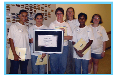
Day of Caring volunteers from The Virginian-Pilot spent the day at St. Mary's, Friday September 7

The Day of Caring also marks the beginning of the United Way's 'season of giving.' It is this time of year when we all fill out our campaign contributions and